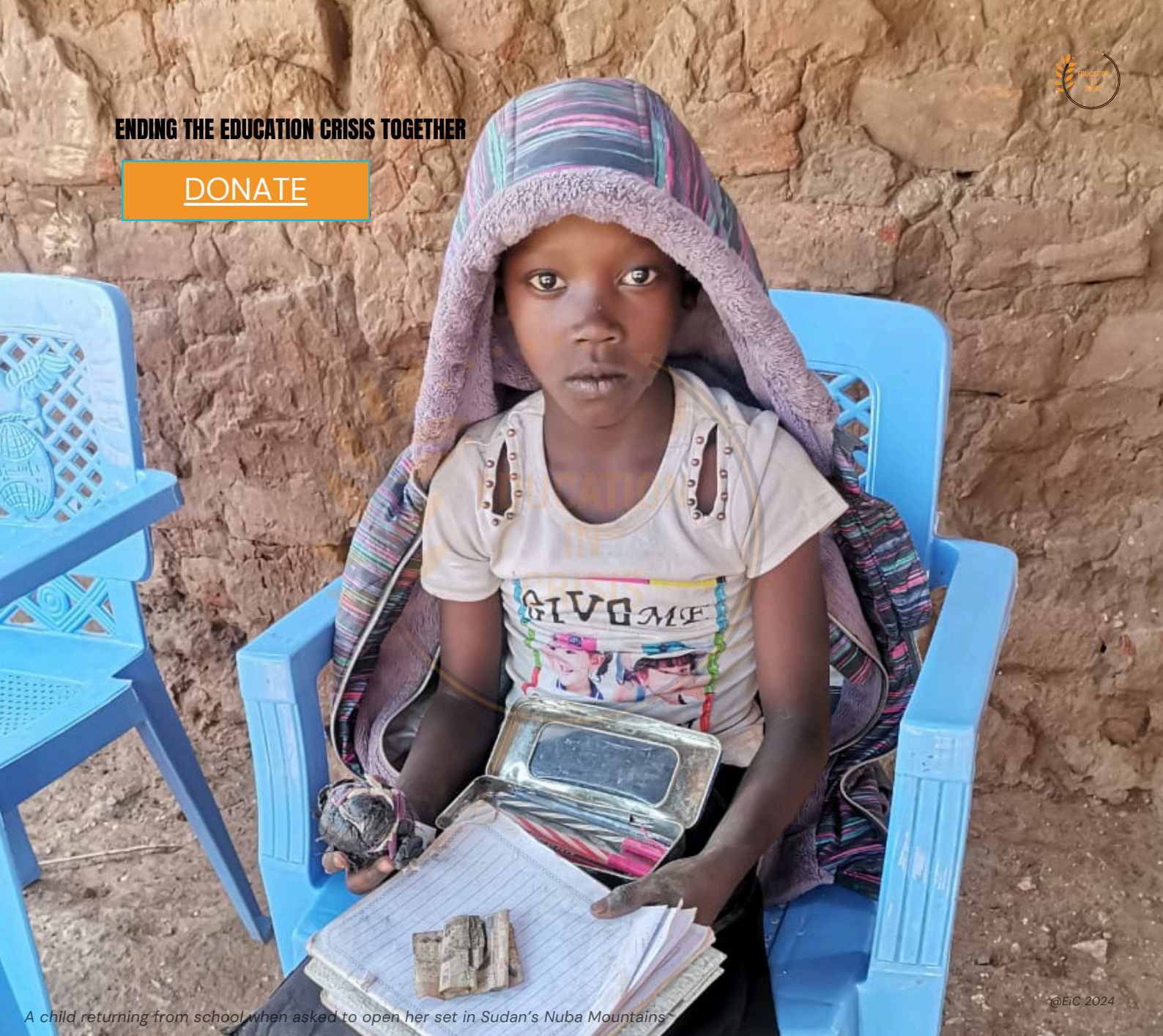
A child returning from school when asked to open her set in Sudan's Nuba Mountains