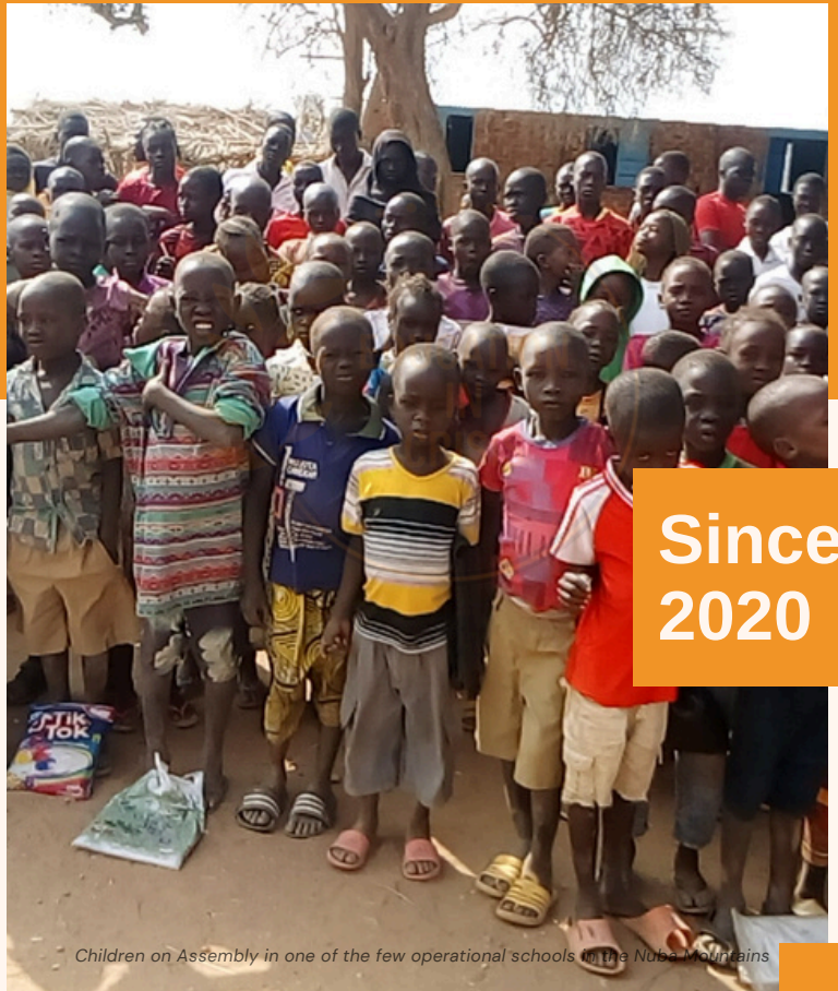
Children on Assembly in one of the few operational schools in the Nuba Mountains

While Education in Crisis and other NGOs on ground through their programs offer some hope, sustainable and large-scale solutions are needed to truly address the education crisis in the Nuba Mountains including political commitment to peace, investment in infrastructure, teacher training, and addressing the underlying causes of poverty and marginalization.